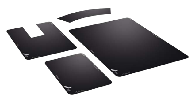
DÜRR NDT Imaging Plates with active side (white/blue) down.

The DÜRR NDT Imaging Plate product range has been carefully designed to fit the specific needs of the non-destructive testing industry with the different types covering the widest range of possible radiographic testing applications.